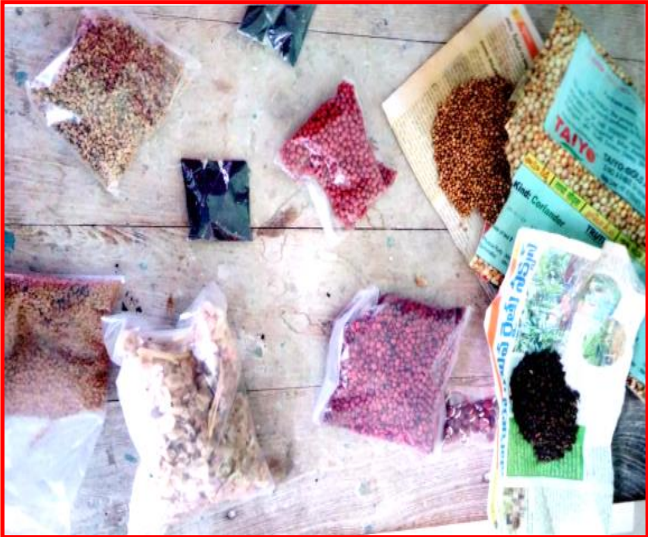
SEEDS OF VARIOUS VEGETABLES & GREEN LEAVES