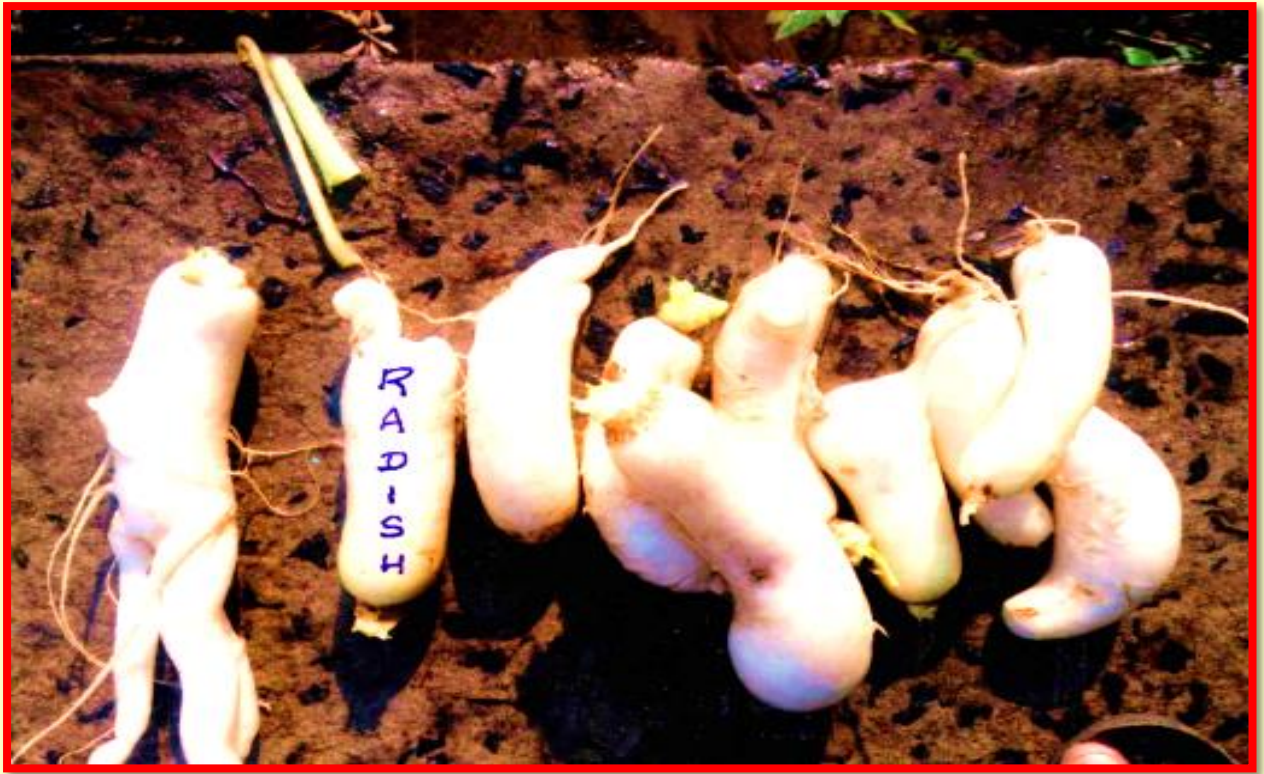
PRODUCT OF RADDISH