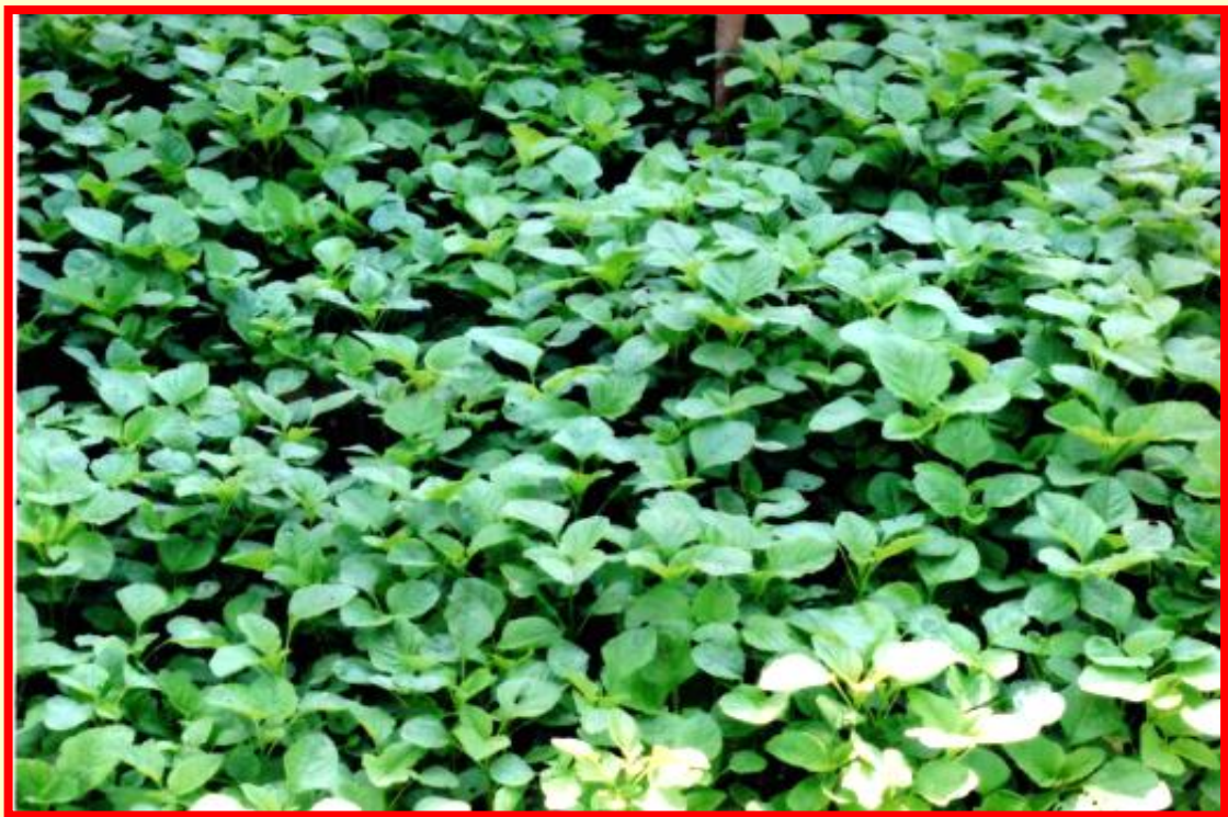
CLUSTER/GUAR BEANS CROP