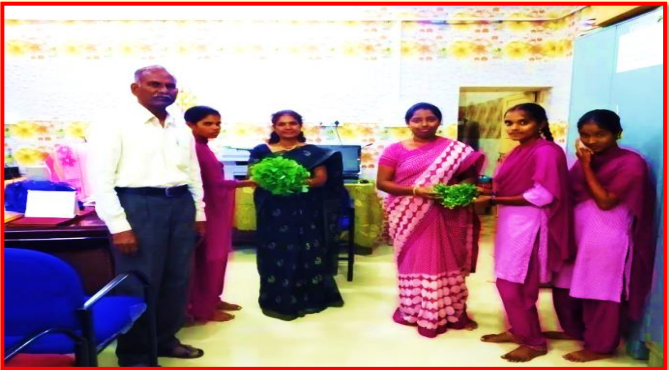
MARKETING GREEN LEAFY VEGETABLES TO THE STAFF