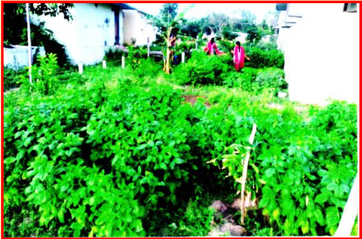
CLUSTER/GUAR BEANS CROP