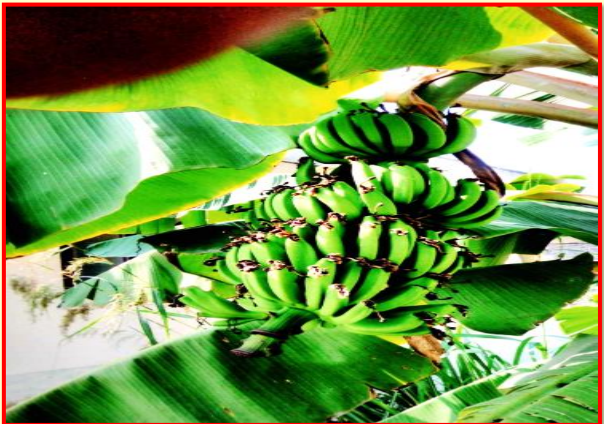
BUNCH OF BANANAS