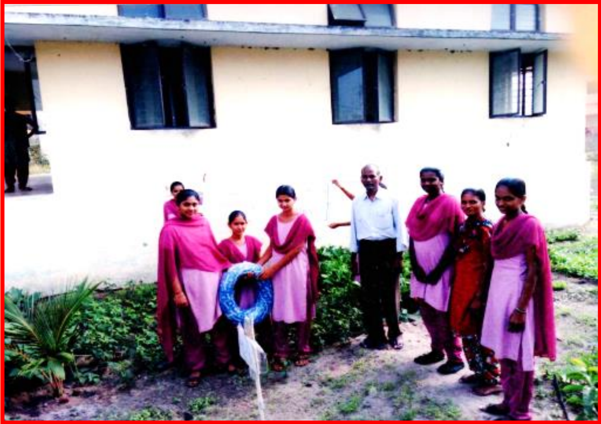
PURCHASED 100 METERS WATER PIPE WITH THE MONEY GENERATED AFTER MARKETING THE ORGANIC FARMING PRODUCTS