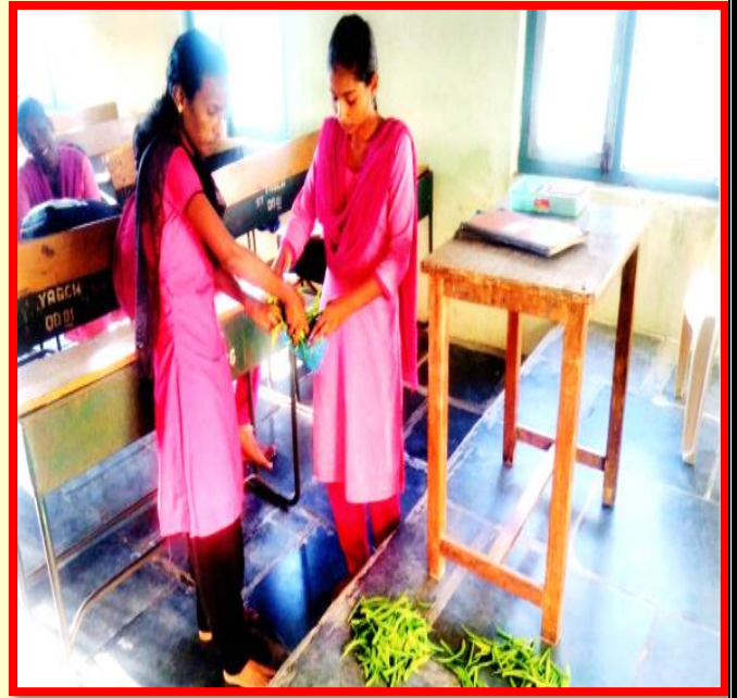
MARKETING CLUSTER (GUAR) BEANS