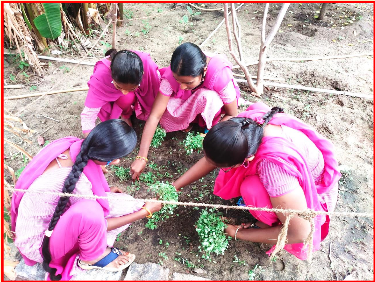
Students harvesting the leafy vegetables