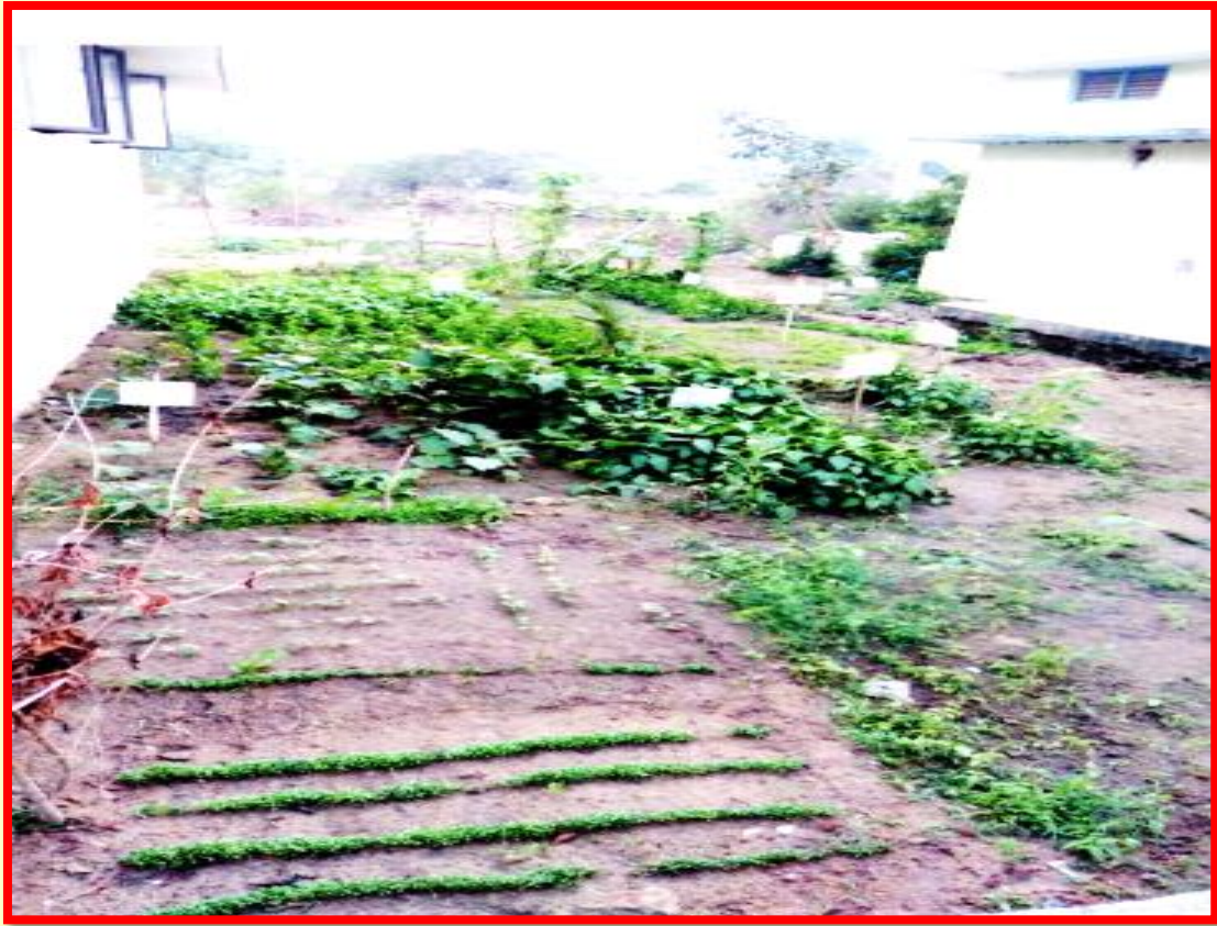
CROP OF GREEN LEAFY VEGETABLES