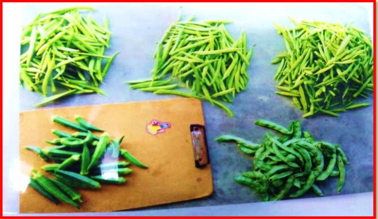
PRODUCT OF VEGETABLES