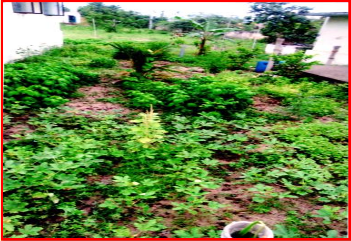
LADY FINGER CROP