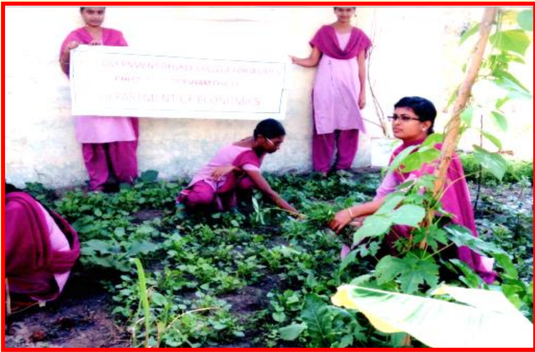
GREEN LEAFY VEGETABLES