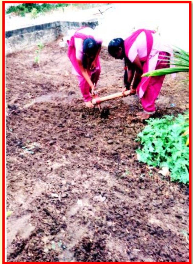
PLOUGHING THE SOIL