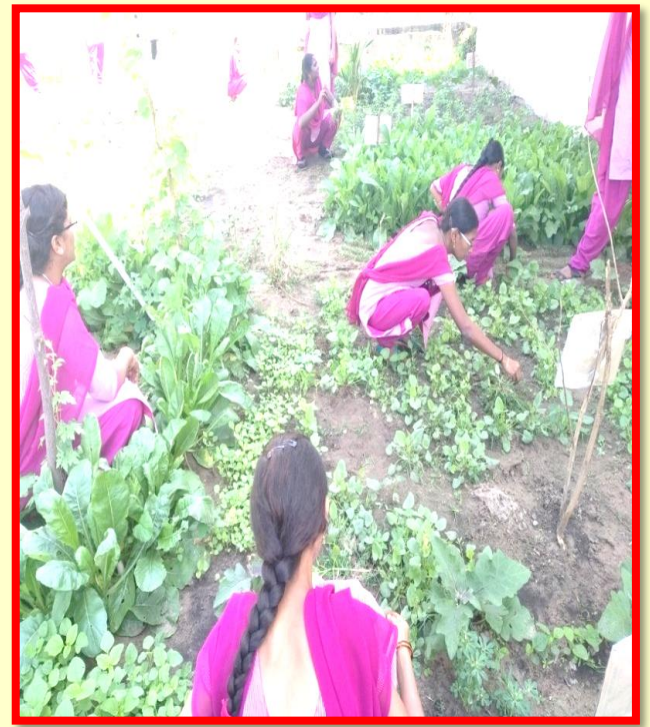
Students harvesting the leafy vegetables